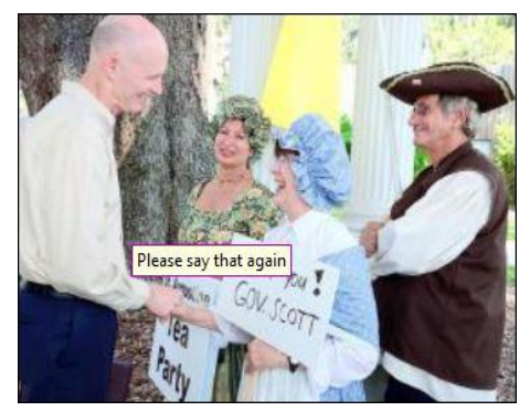
August 29, 2011

Florida that the 'Grassroots Tea Party' had survived